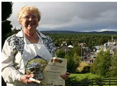
World Champion Porridge Maker 2005 and Speciality Porridge Maker 2004